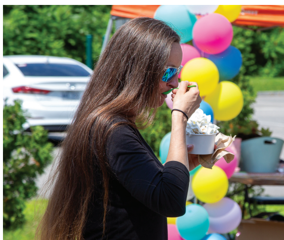
Trails End supplied ice cream.