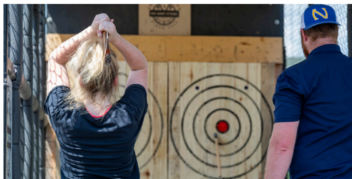
Axe throwing was a popular activity at the party!