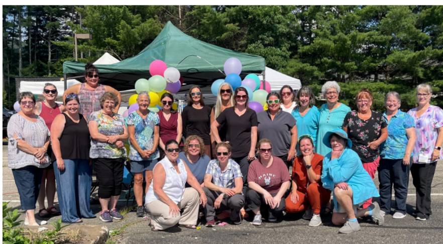
The gang's all here!