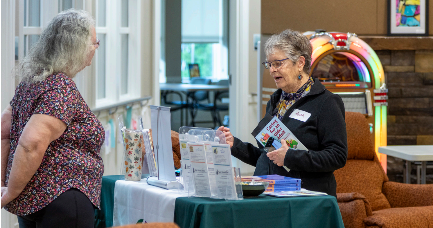
Caregivers received information and resources.